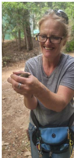
Jax banding a Flycatcher