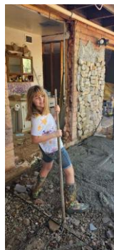
Legos, Zoo, Pool, Cement