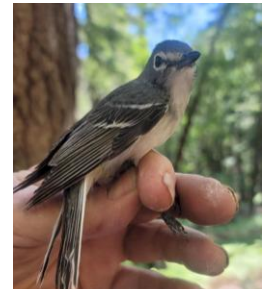
Research on Mt. Lemmon