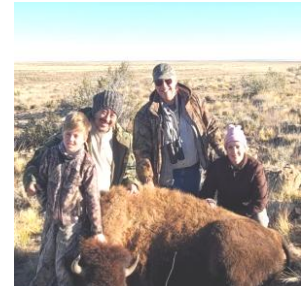
Great Bison Hunt