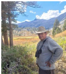
Kale in the High Mountains