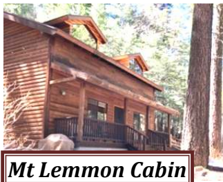
Mt Lemmon Cabin

where the birds winter in Mexico. This next spring they will try to recapture those birds that return, and remove the geolocators to analyze where they spend their winters. The COFL in Colorado wintered in Acapulco, Mexico, and it will be interesting to find out where the Arizona birds winter. This past December Charles also went hunting with Kale for Coues deer in the southern Arizona mountains east of Ajo, and Kale got the bigger buck. He then took Jacque on an elk hunt in northern Arizona over thanksgiving. They stayed at our condominium in Flagstaff, but were snowed out for much of